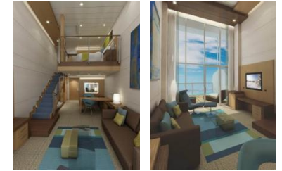
Crown Loft (looking in)