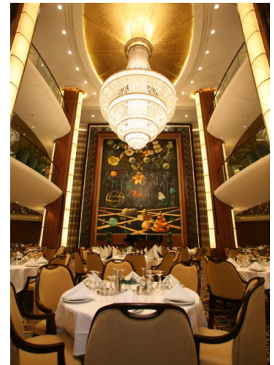
Crown Loft (looking out)